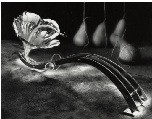
Hibiscus Ladle by Robyn Nichols